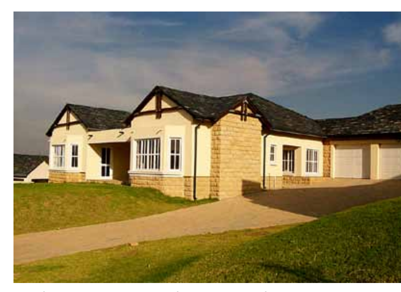
One of the residences as the Waterfalls Hills Mature Lifestyle Estate at Sunninghill.

The addition of CHRYSO®Pareflo 20 pre-sealer effectively creates a permanent chemical bond and extends the life of the product by preventing water penetration as well as preserving the sandstone appearance of the product.